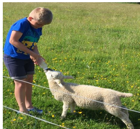
Chairladys Rally – Parkers Farm