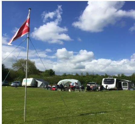
Cider & Wot Not – Rally field