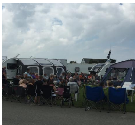
Trevarrian – Closing Flag