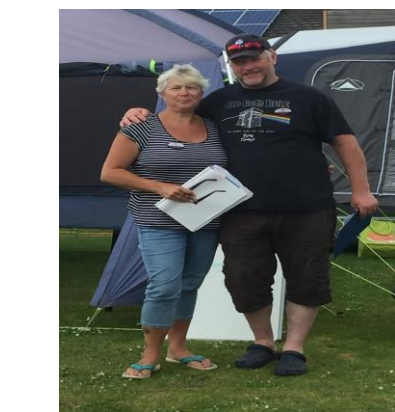
Trevarrian – D&C Chairlady & Vice Chairman