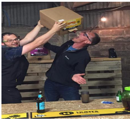
Cider & Wot Not – Glass shortage