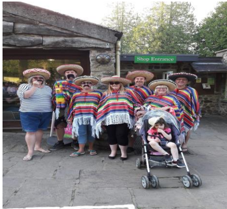
River Dart – Mexican Night