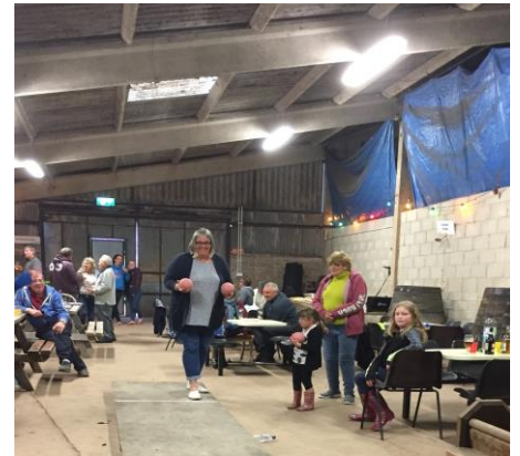
Cider & Wot Not – Skittles night